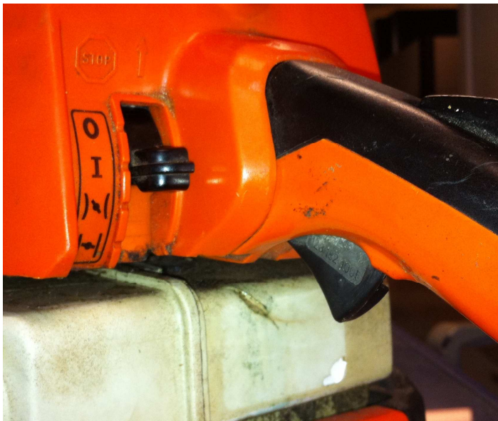
Off – Run – ½ Choke – Full Choke